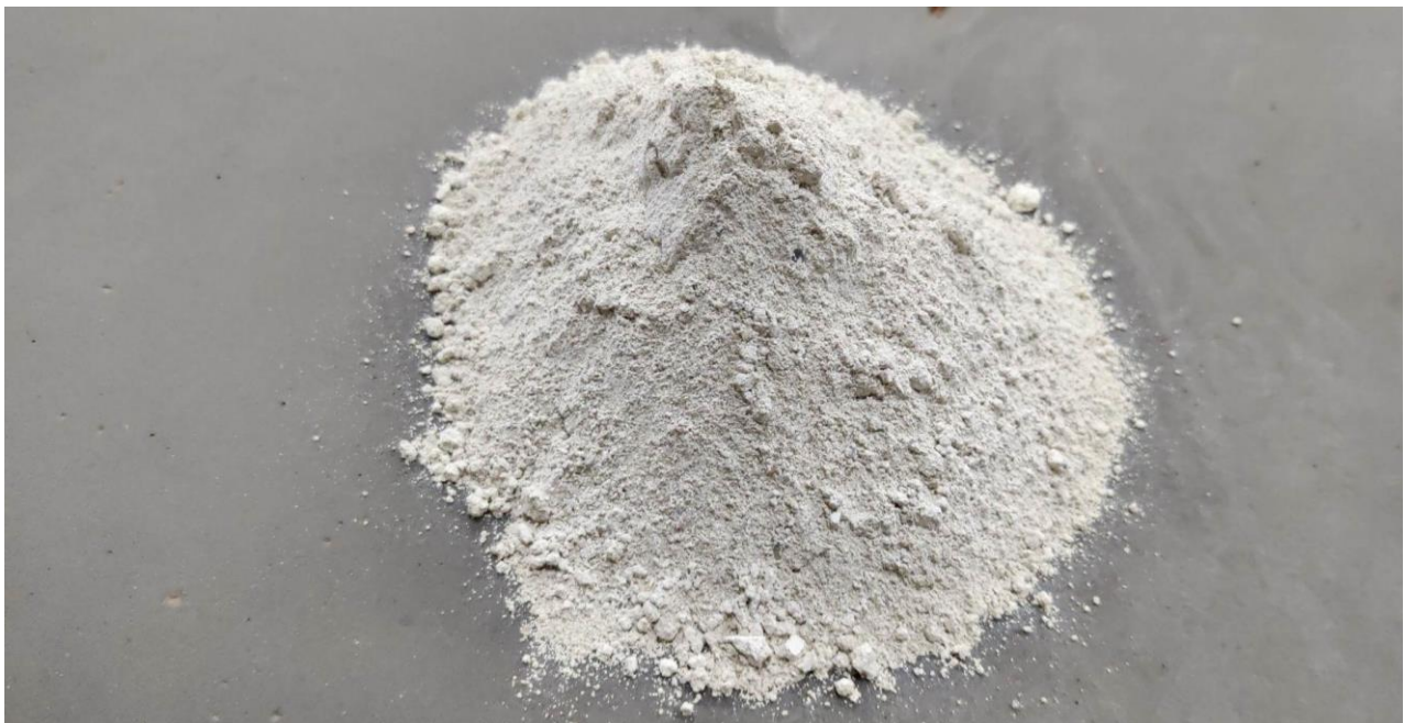
Figure 2 – Picture of the declared products, without packaging.