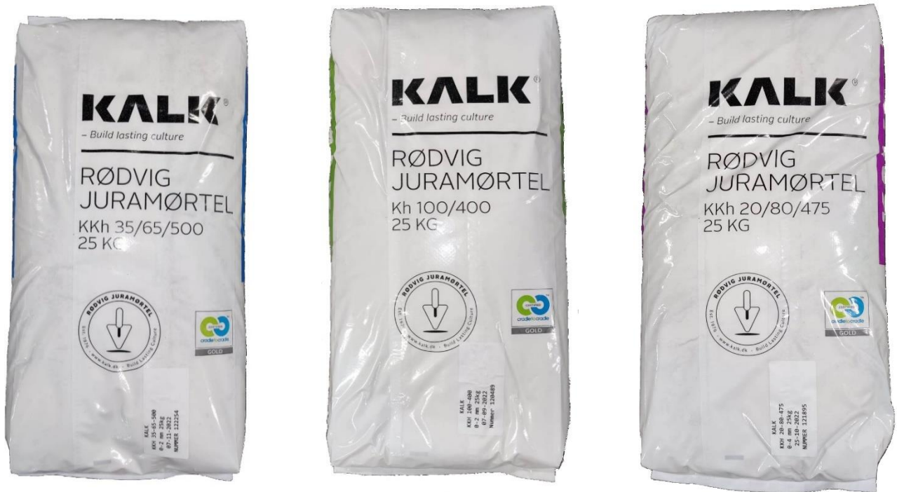
Figure 1 – Pictures of the declared products, with packaging.