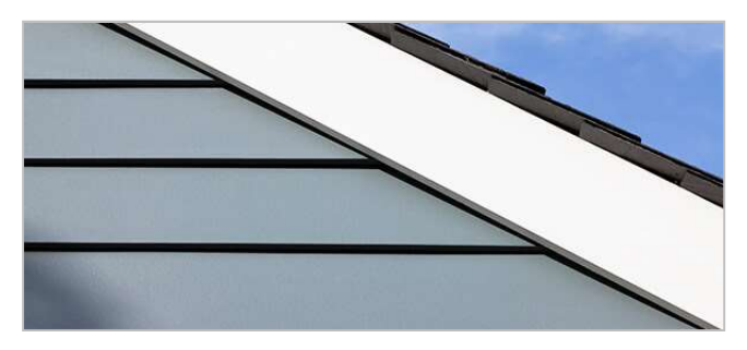
FIGURE 3: HARDIELINEA® IN USE

Fibre cement boards produced by James Hardie are classified CPC 37570 under the UN CPC classification system v2.1.