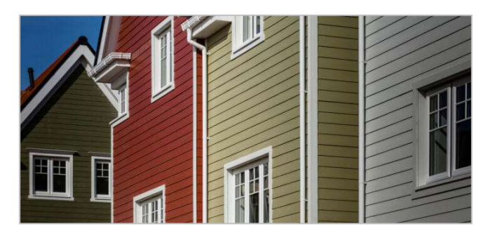
FIGURE 1: HARDIEPLANK® IN USE

This EPD applies to three painted fibre-cement panel products used for external cladding of buildings: HardiePanel®, HardiePlank® and HardieLinea® (pictures below). The products are supplied as panels (boards) of standard dimensions. These products have been engineered for maximum longevity in the European climate, and withstand a diverse range of weather conditions such as wind, rain, hail, snow and sun. They are also resistant to mould, decay, pests and rot.