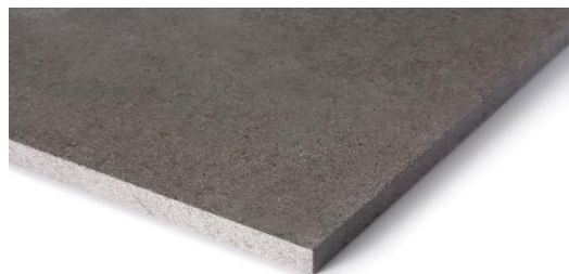
Cembrit Windstopper Extreme (Anthracite)